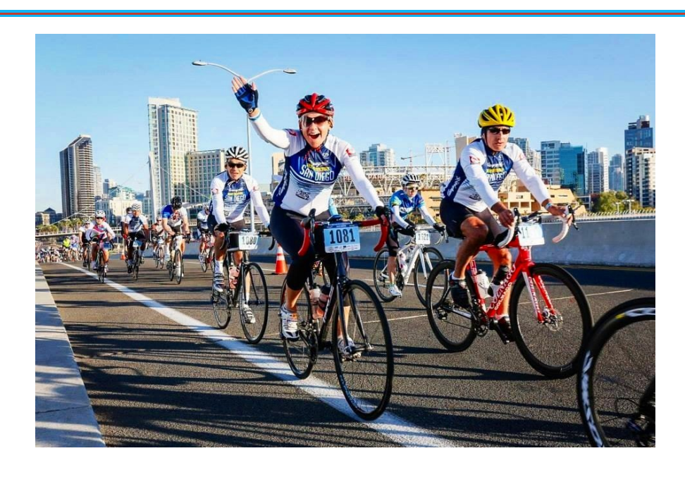
The 16th Annual GranFondo San Diego -Sunday April 21st, 2024