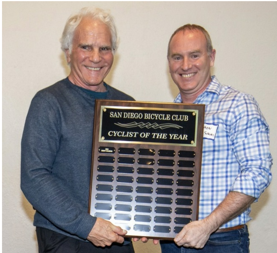
2023 Award Recipients