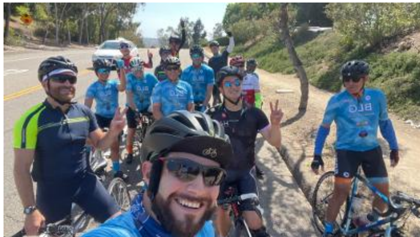
SDBC D1 enjoying a beautiful Saturday ride