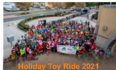
Holiday Toy Ride 2021