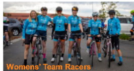
Womens' Team Racers