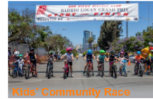
Kids' Community Race