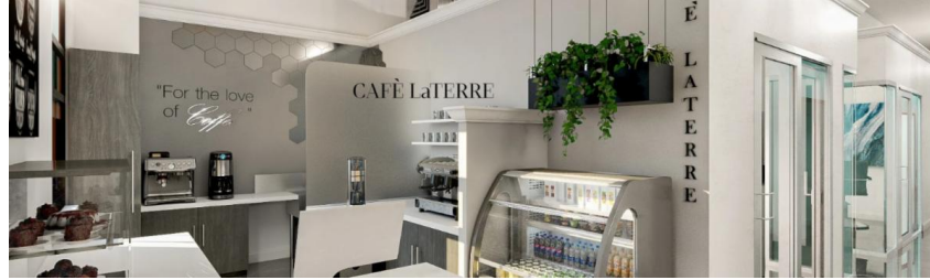
The Saturday Ride coffee stop